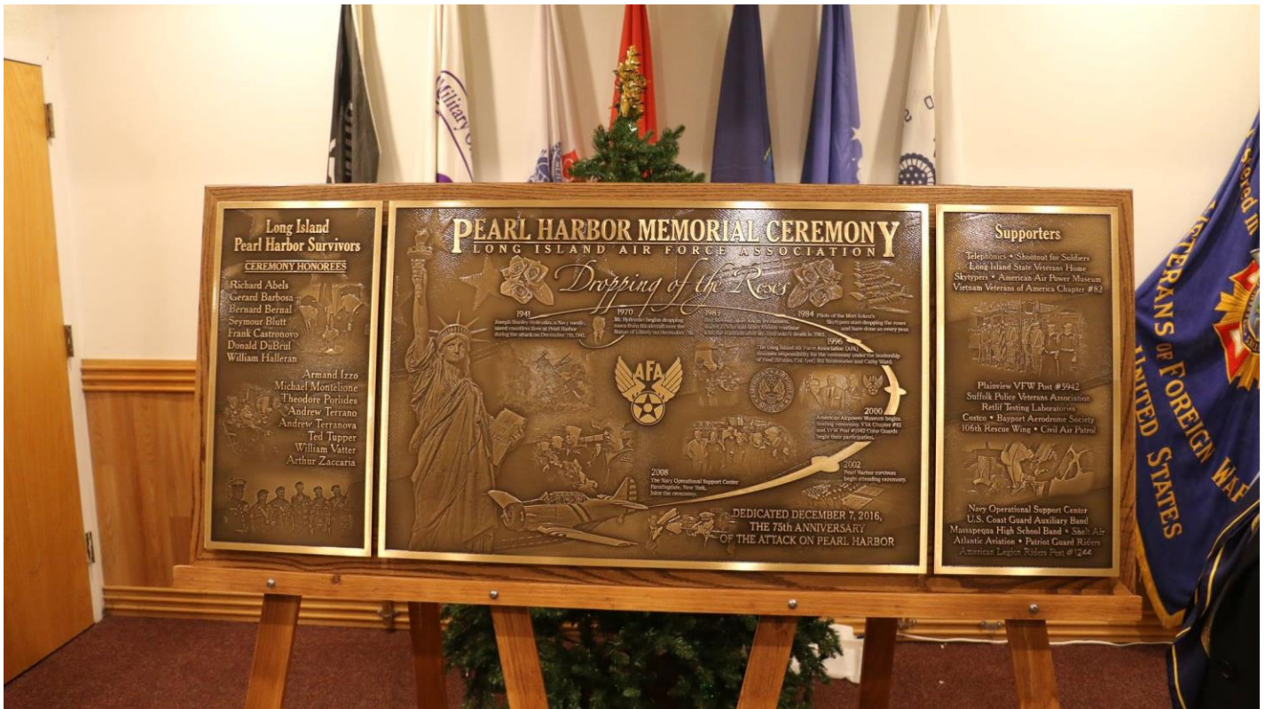
Pearl Harbor Plaque