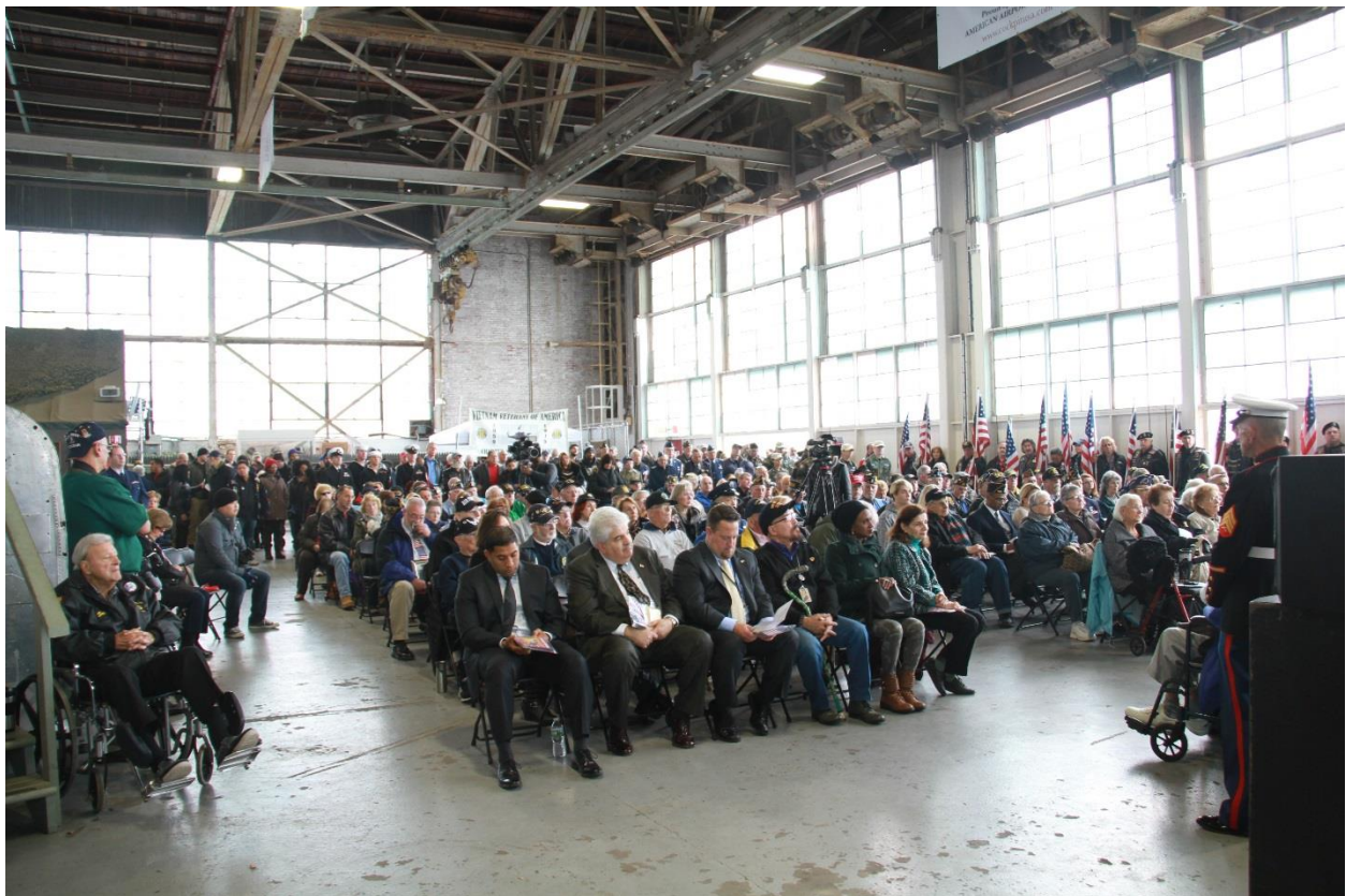
The audience inside the hangar.