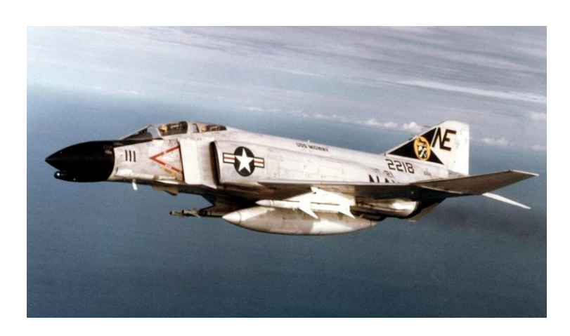
Vietnam War F-4 Phantom