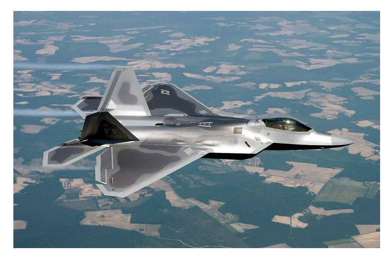
Lockheed Martin F-22 Raptor

In short, modern fighters are designed for stealth, greater range and increased weapons payload rather than simply speed.