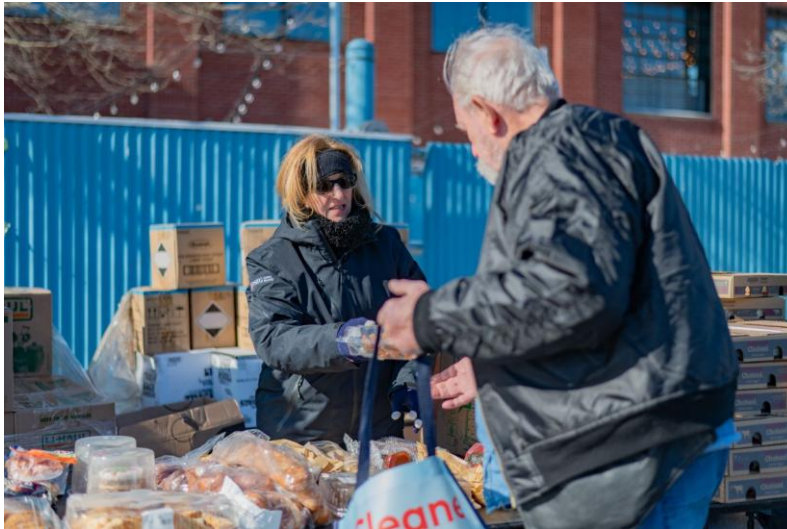
PSEG volunteer passing out food to a veteran

Hosted by the Economic Opportunity Council of Suffolk, Inc. – Supportive Services for Veterans Families and Blue Point Brewing Co. on January 27 at the Blue Point Brewpub at 225 West Main St. in Patchogue, this event featured food distribution provided by Long Island Cares and Island Harvest, housing support, mental health services and community support resources from local veteran-focused organizations.