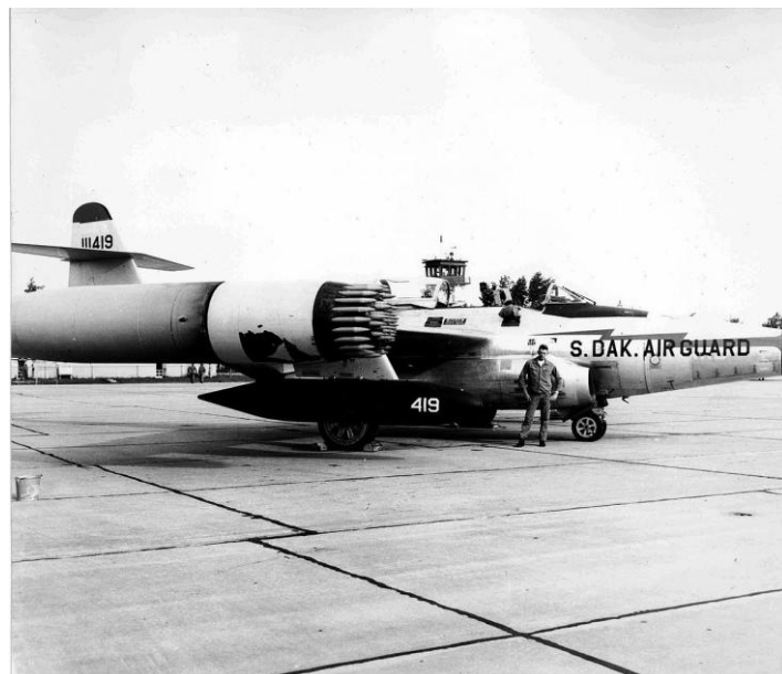
F-89D loaded with rockets, 114 th Fighter Interceptor Group, 1958