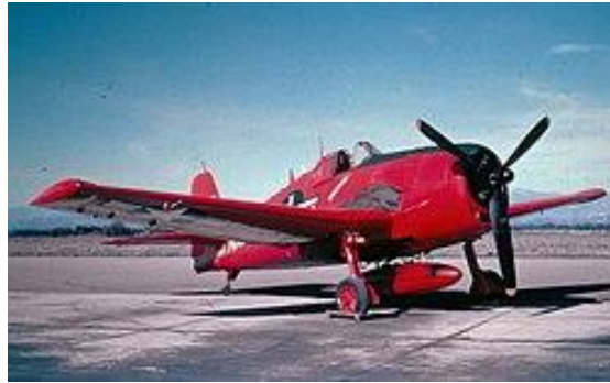
Grumman F6F-5K drone

penetrated a home and garage on 4 th Street East. One rocket struck right in front of a vehicle being driven west on California State Route 138 near Tenth Street West, of which one tire was shredded, and many holes were punched through the car's body. Two men in Placerita Canyon had been eating in their utility truck; right after they left it to sit under the shade of a tree, a rocket struck the truck, destroying it. Many fires were started near Santa Clarita, with three large ones and many smaller ones in and around Palmdale. It took 500 firefighters two days to bring the brushfires under control. In all, 1000 acres were burned.