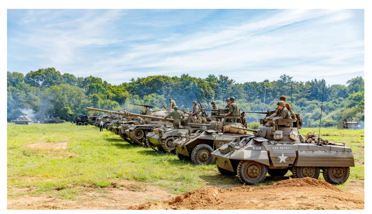
A lineup of some of the Museum's combat vehicles and tanks.