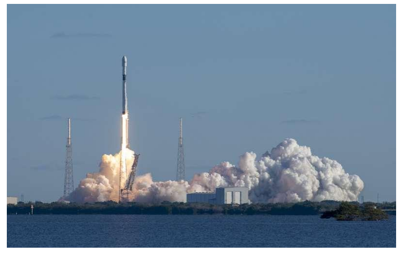
SpaceX's Falcon 9 rocket carrying the GPS III satellite launched from Cape Canaveral.