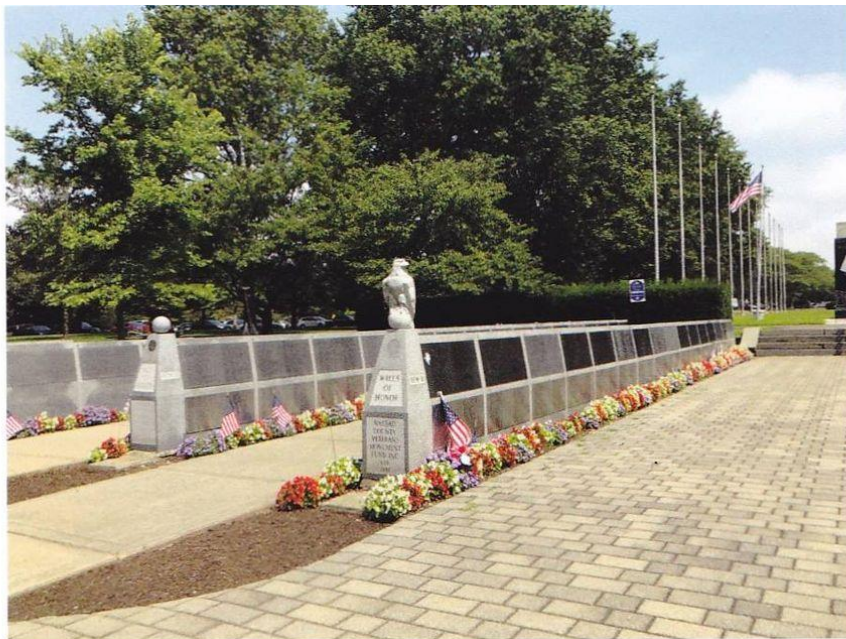
Walls of Honor at Eisenhower Park