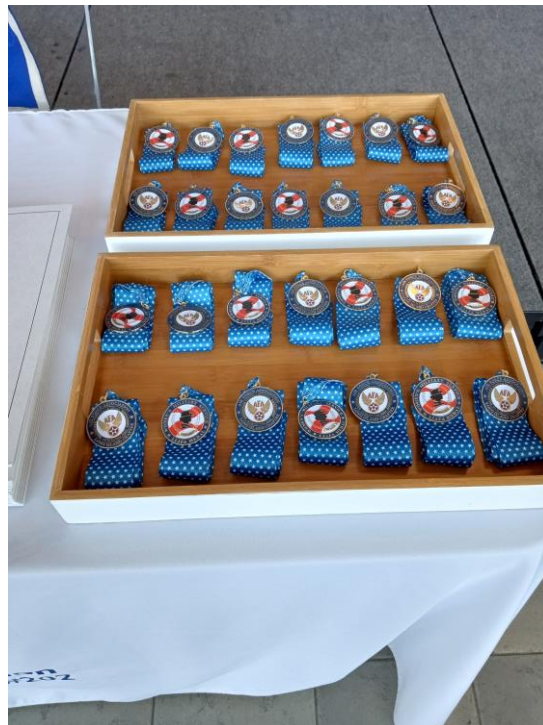
Close-up photo of the medals