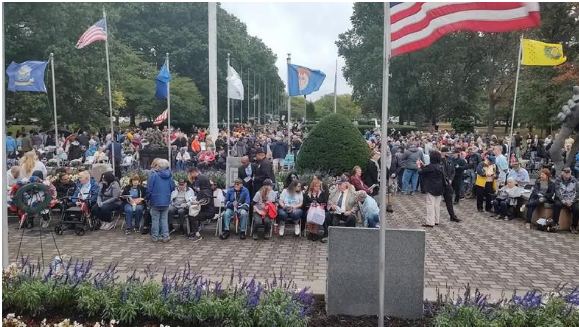
View of the crowd at the Walls of Honor Ceremony