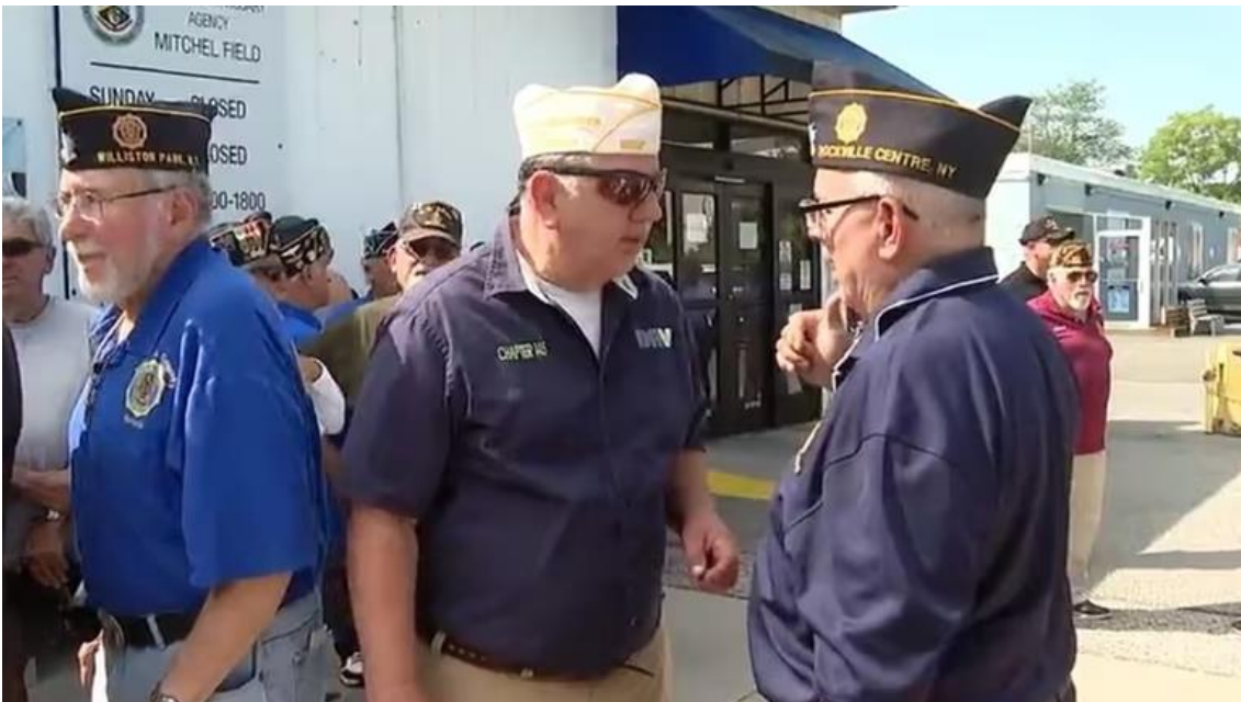
Veterans gathered for the rally outside the shuttered commissary.