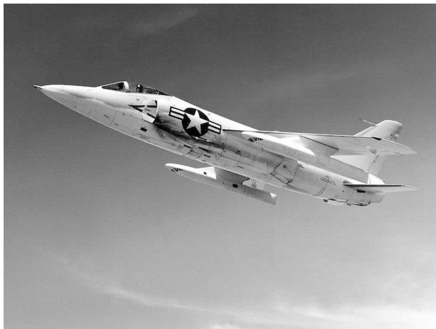
Grumman F11F Tiger. The F11F was the second supersonic fighter in U.S. Navy service.