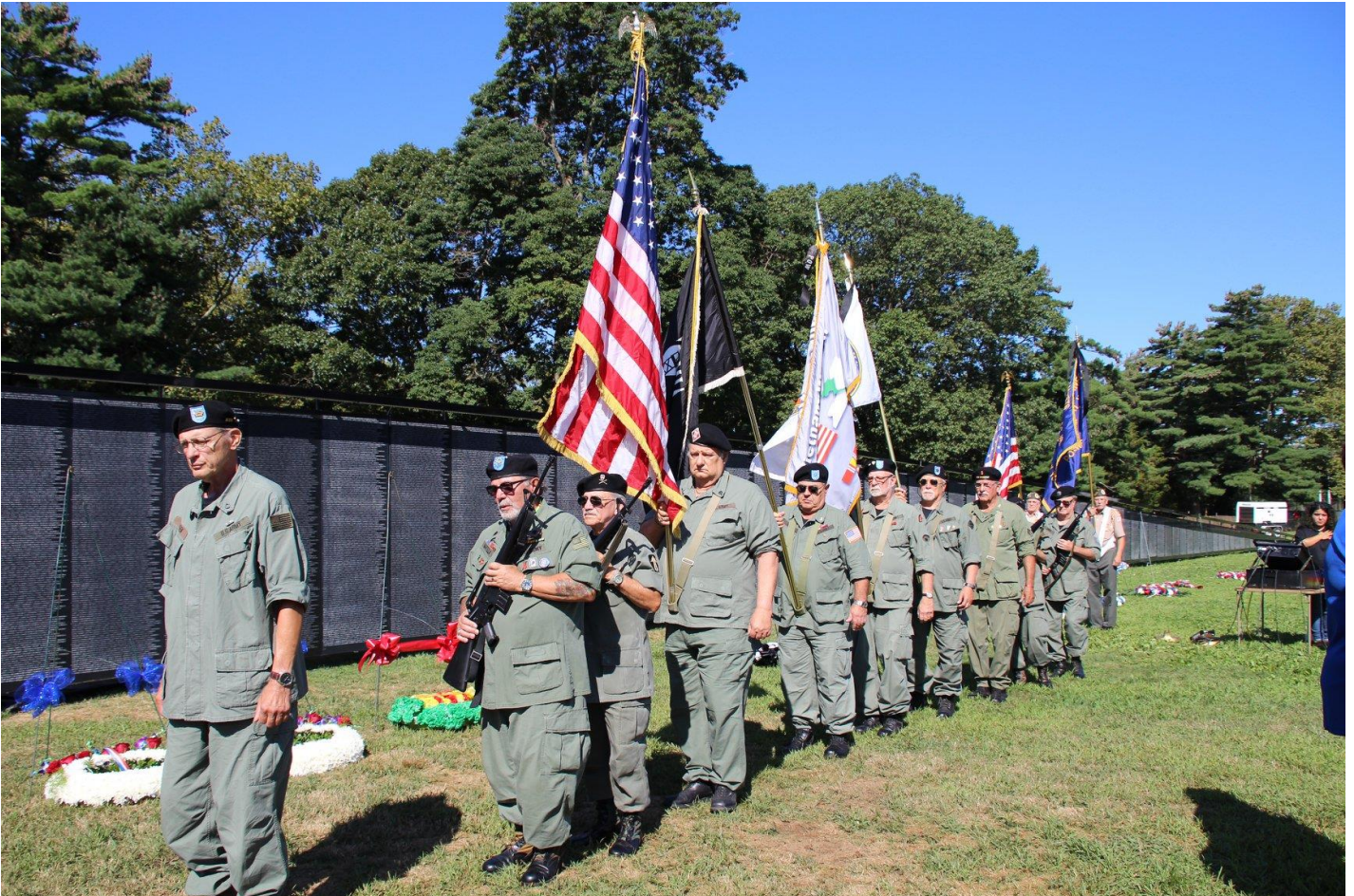
Vietnam War Veterans Association Color Guard at The Wall That Heals at Eisenhower Park

The Wall That Heals visited Nassau County from Thursday, August 29 through Sunday, September 1 at Eisenhower Park, Field 2 in East Meadow. There was a candlelight vigil on Friday, August 30 at 7 PM; the closing ceremony was on Sunday, September 1 at 2:30 PM. The Wall That Heals is a three-quarter scale replica of the Washington, D.C. Vietnam Memorial Wall; it is 375 feet long and stands 7.5 feet high at its tallest point. The 53-foot trailer that carries the Wall transforms to become a mobile Education Center, which carries additional exhibits about the Vietnam Veterans Memorial in Washington, D.C., among which is a video display of names and photos of local area service members whose names are on the Wall. The memorial wall is a tribute and remembrance to the 58,318 military service members who gave the ultimate sacrifice for freedom during the Vietnam War.