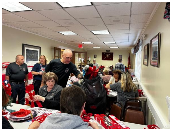
Red Bow volunteers getting it done!

On Saturday, November 15 , the Blue Star Mothers and volunteers came together at the Sunrise Detachment Marine Corps League building in Massapequa to set up 500 Christmas trees to help veterans in need during the 2025 holiday season. The red bows tied to the tops of the trees were originally placed on the graves of American service members the prior year in honor of their service and sacrifice. Additionally, volunteers helped pack food and spices to send to our service members overseas.